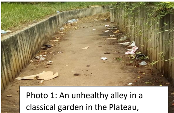
Photo 1: An unhealthy alley in a classical garden in the Plateau, photo by the authors, 2020