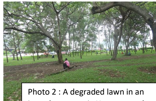
Photo 2 : A degraded lawn in an interchange ear in Yopougon, photo by the authors, 2020