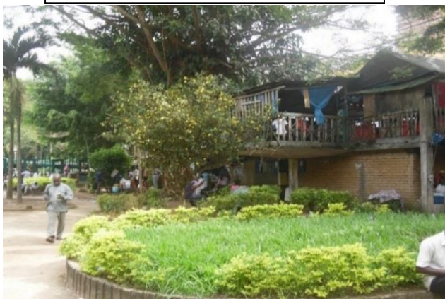
Photo 3 : a restaurant built in a classical garden in the Plateau, 2020