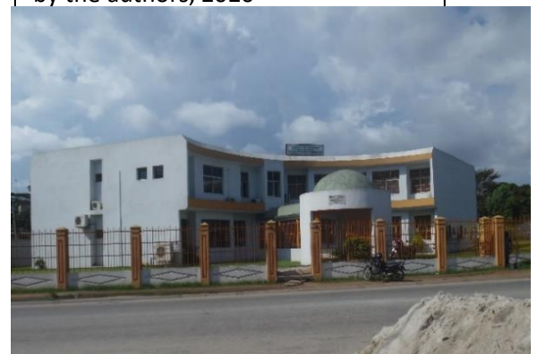
Photo 4 : a town hall annex built in a former public garden in Yopougon, photo by the author, 2020

- Explanatory factors for the decrease and the degradation of public parks and gardens